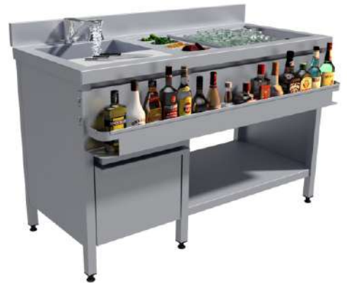
COCKTAIL STATION SIZE : CUSTOMIZED (DIE-203)