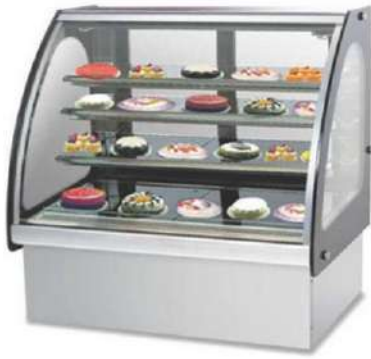
BAKERY/SWEETS DISPLAY COUNTER SIZE : CUSTOMIZED (DIE-147)