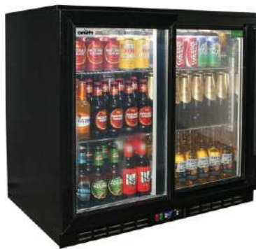
TWO DOOR BACK BAR CHILLER (DIE-202) SIZE : STANDARD (IMPORTED)