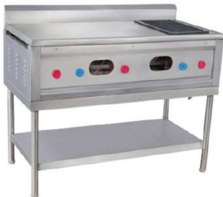
CHAPATI PLATE WITH PUFFER SIZE : CUSTOMIZED (DIE-107)