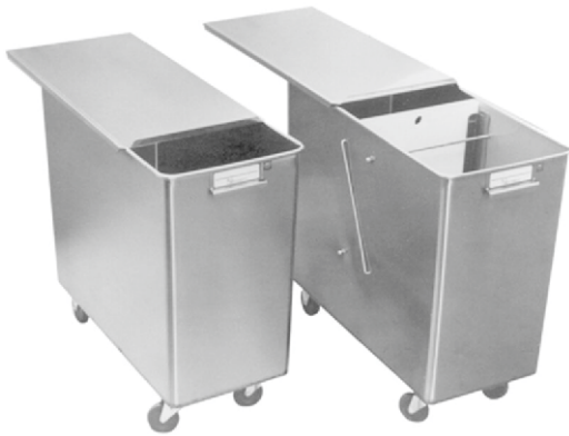
ATTA / MAIDA BIN SIZE : CUSTOMIZED (DIE-173)