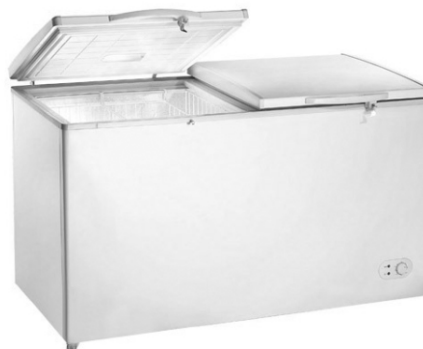
CHEST FREEZER (DIE-141) CAPACITY : 100 TO 1000 Ltr.