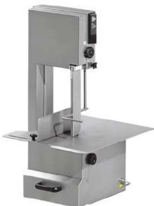
BONESAW (ELECTRIC) (DIE-125) BLADE : 16/20 mm