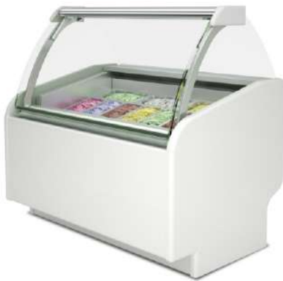
ICE CREAM PARLOR SIZE : CUSTOMIZED (DIE-150)