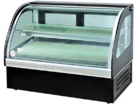
TABLE TOP BAKERY/SWEETS DISPLAY COUNTER SIZE : CUSTOMIZED (DIE-149)