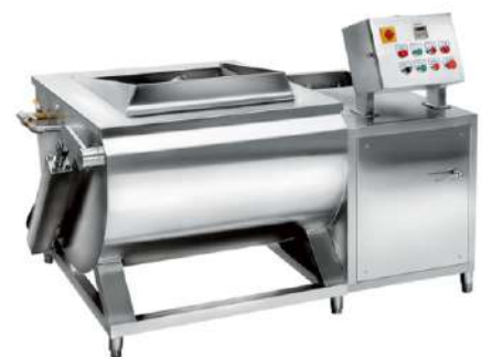
VEGETABLE WASHER SIZE : CUSTOMIZED (DIE-127) CAPACITY : 40 TO 80 Kg.