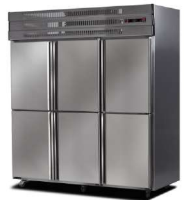
VERTICAL SIX DOOR SIZE : CUSTOMIZED (DIE-142) CAPACITY : 1800 Ltr.