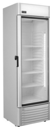
VISI COOLER (DIE-144) CAPACITY : 300 TO 500 Ltr.