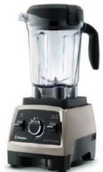
2 SPEED BLANDER