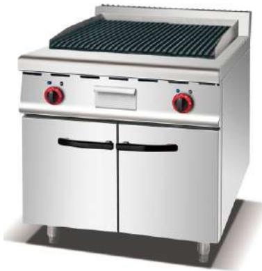
LAVA GRILL (GAS/ELECTRIC) SIZE : CUSTOMIZED (DIE-111)