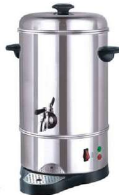
WATER/MILK BOILER CUSTOMISED / IMPORTED CAPACITY : 10 TO 40 Ltr. (DIE-162)