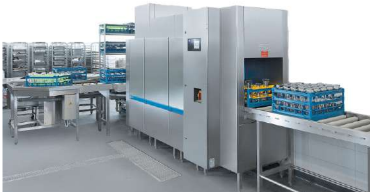
RACK CONVEYOR DISH WASHER (DIE-135) CAPACITY : 100 TO 180 RACK/HOUR