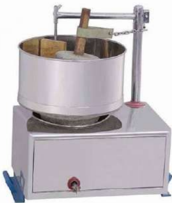
WET MASALA GRINDER (ELECTRIC) (DIE-119) CAPACITY : 5 TO 25 Ltr.