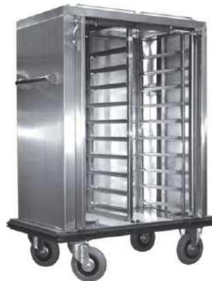
HOT FOOD SERVICE TROLLEY SIZE : CUSTOMIZED (DIE-171)