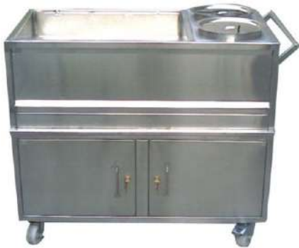
HOT FOOD SERVICE TROLLEY SIZE : CUSTOMIZED (DIE-167)