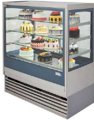
BAKERY/SWEETS DISPLAY COUNTER SIZE : CUSTOMIZED (DIE-148)