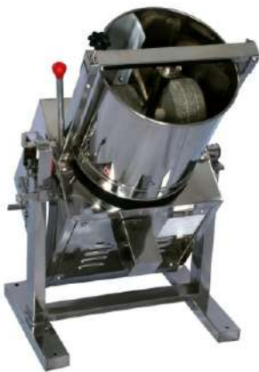
TILTING WET GRINDER (ELECTRIC) (DIE-122)