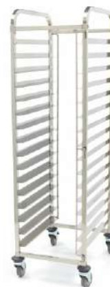
TRAY RACK TROLLEY SIZE : CUSTOMIZED (DIE-197)