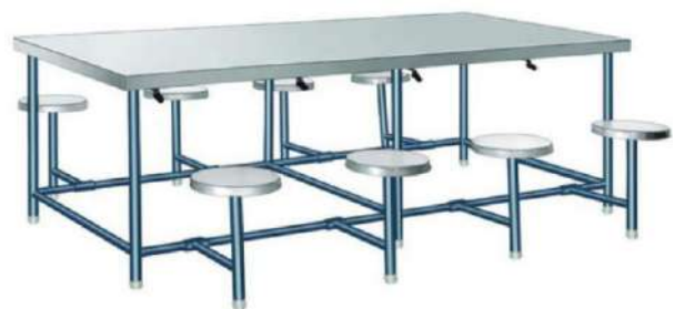
DINNING TABLE WITH SEATER SIZE : CUSTOMIZED (DIE-180)