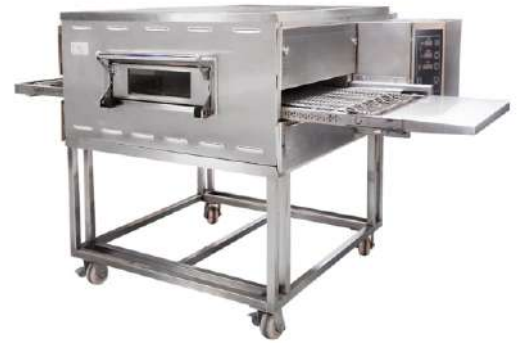
CONVEYOR PIZZA OVEN ELECTRIC/GAS (DIE-156) INDIAN/IMPORTED