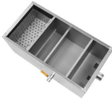
GREASH TRAP SIZE : CUSTOMIZED (DIE-129)