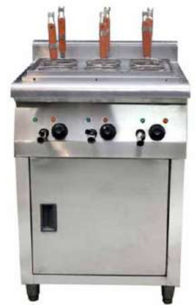
PASTA COOKER SIZE : CUSTOMIZED (DIE-106)