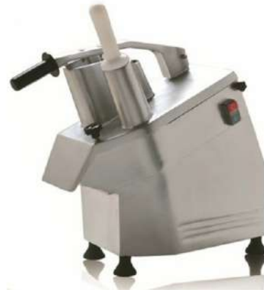
VEGETABLE CUTTING MACHINE (ELECTRIC) (DIE-123) CAPACITY : 40 TO 200 Kg./Hr.