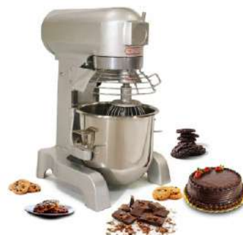
PLANETARY MIXER (IMP/IND) CAPACITY : 5 TO 80 Ltr. (DIE-191)