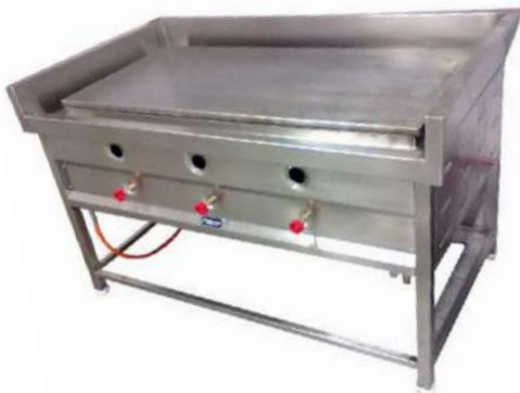
DOSA PLATE SIZE : CUSTOMIZED (DIE-104)