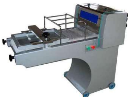
DOUGH MOULDER IND/IMP SIZE : CUSTOMIZED (DIE-189)