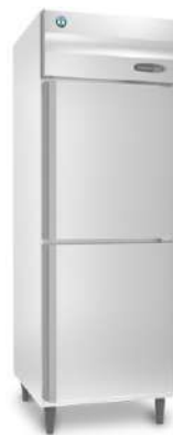
VERTICAL TWO DOOR (DIE-145) CAPACITY : 400 TO 600 Ltr.