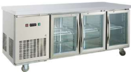
GLASS (DOOR UNDER COUNTER) SIZE : CUSTOMIZED (DIE-140)