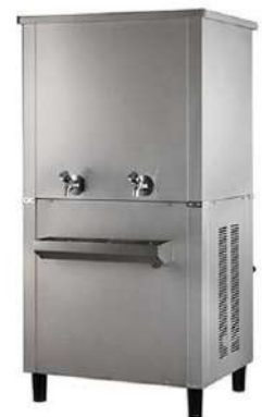
WATER COOLER (DIE-172) CAPACITY : 25 TO 1000 Ltr.