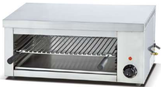
SALAMANDER SIZE : CUSTOMIZED (DIE-157)