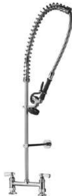
PRE RINCE (DIE-132) IMPORTED/BRANDED