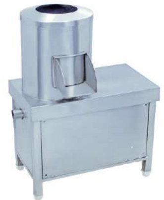
POTATO PEELER (ELECTRIC) (DIE-124) CAPACITY : 5 TO 50 Kg.