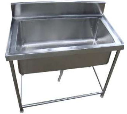
POT WASH UNIT SIZE : CUSTOMIZED (DIE-134)