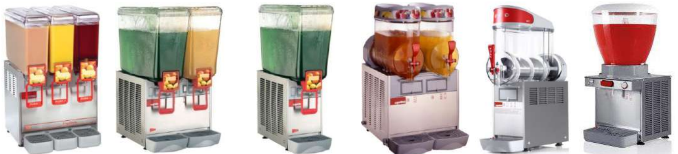
COMPACT 8/3 DELUXE 12/2A ARCTIC DELUXE 12/1 MT 2 GL MT 1 MINI A 19

Machines for dispensing real frozen and cold /chilled beverages. The most innovating versatile, compact that totally display the product so as to catch the customer's eye. Realized in order to increase profits, while costs of drinks, tune, labour and stocking space are reduced. Cleaning of each part in contact with the drink