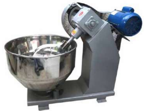
DOUGH KNEADER (ELECTRIC) (DIE-121) CAPACITY : 5 TO 100 Ltr.