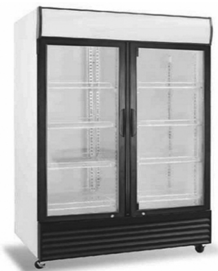
VERTICAL GLASS DOOR (DIE-143) CAPACITY : 400 TO 600 Ltr.