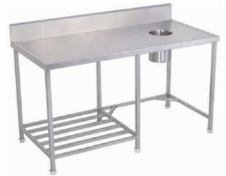
DIRTY DISH LANDING TABLE SIZE : CUSTOMIZED (DIE-130)