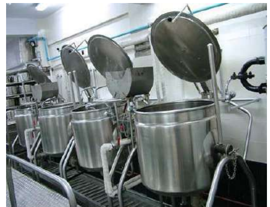
STEM COOKING VESSELS WITH STEAM GENERATOR (GAS OPERATOR) SIZE : CUSTOMIZED (DIE-118)