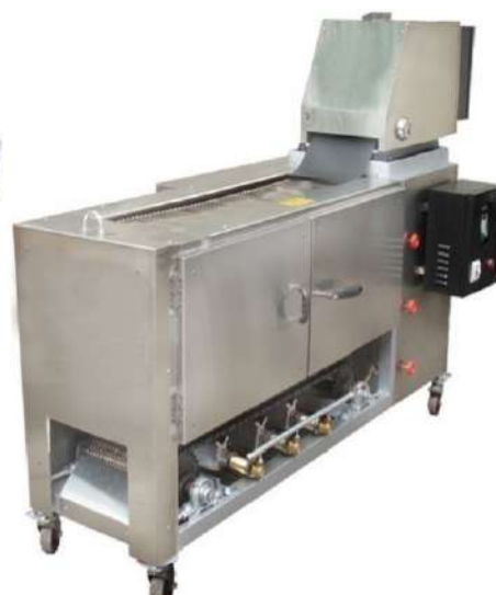
CHAPATI MAKING MACHINE (DIE-186) CAPACITY : 800 TO 1000 CHAPATI/Hr.