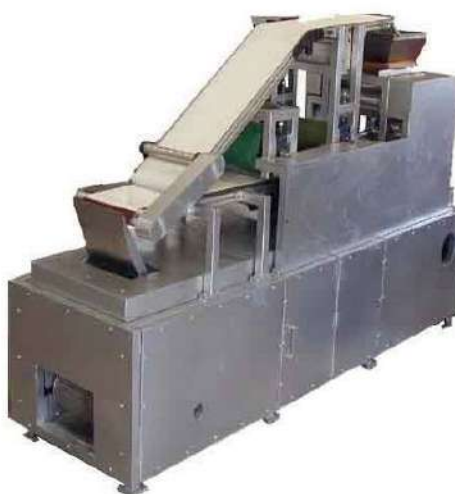
FULLY AUTOMATIC CHAPATI MACHINE (DIE-185) CAPACITY : 1000 TO 4000 CHAPATI/Hr.