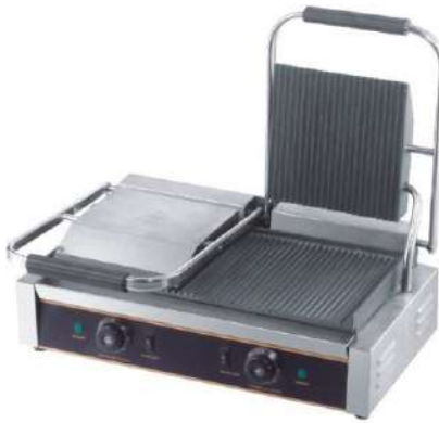
SANDWICH GRILER (ELECTRIC) SINGLE / DOBLE (DIE-155) (STD/JAMBO)