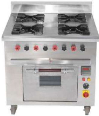
FOUR BURNER RANGE WITH OVEN SIZE : CUSTOMIZED (DIE-101)