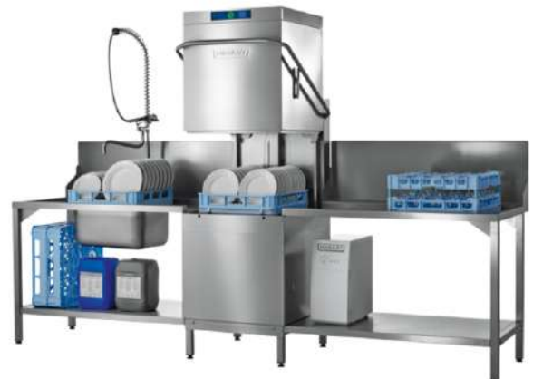
HOOD TYPE DISH WASHER (DIE-136) CAPACITY : 22 TO 60 RACK/HOUR