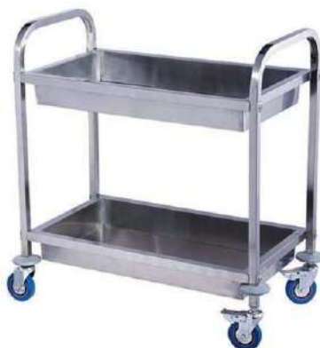
CHAPATI COLLECTION TROLLEY SIZE : CUSTOMIZED (DIE-187)