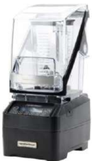
COMMERCIAL SUMMIT BLANDER