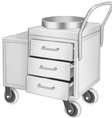
TEA SERVICE TROLLEY SIZE : CUSTOMIZED (DIE-168)