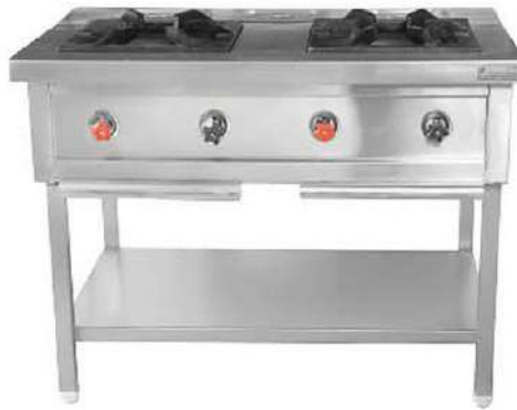
TWO BURNER RANGE SIZE : CUSTOMIZED (DIE-102)