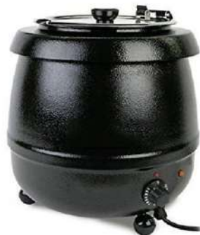
SOUP KETTLE STANDARD/BRANDED (DIE-161) CAPACITY : 7 TO 15 Ltr.