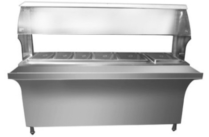
BAIN MARIE FRONT GLASS & TRAY SLIDE SIZE : CUSTOMIZED (DIE-166)