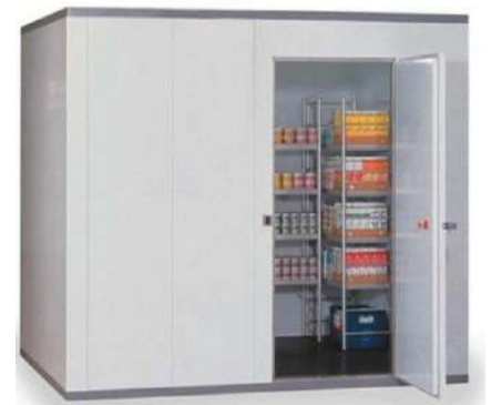
WALK IN CHILLER WALK IN FREEZER SIZE : CUSTOMIZED (DIE-146)