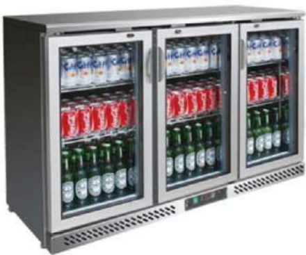
THREE DOOR BACK BAR CHILLER (DIE-201) SIZE : STANDARD (IMPORTED)