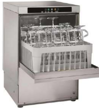
GLASS WASHER SIZE : CUSTOMIZED (DIE-199)