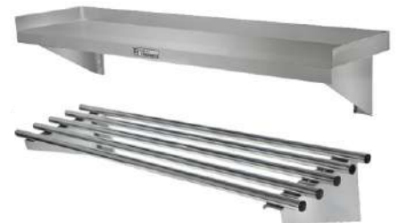
WALL SHELF SIZE : CUSTOMIZED (DIE-178)