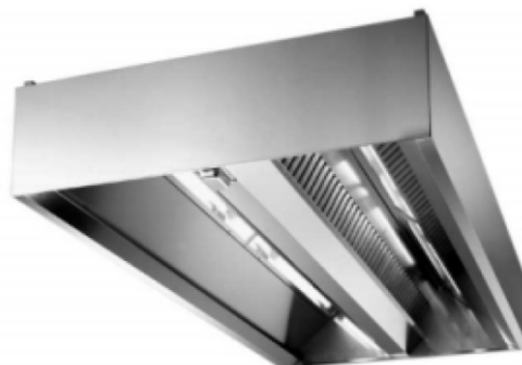
ISLAND EXHAUST HOOD SIZE : CUSTOMIZED (DIE-183)