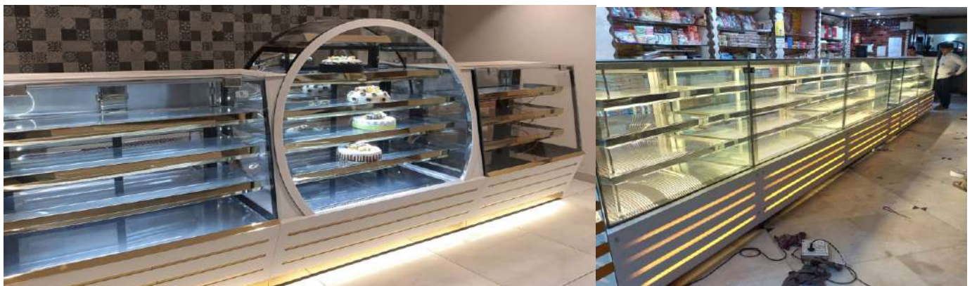
BAKERY / SWEETS DISPLAY COUNTER SIZE CUSTOMIZED (DIE-153)