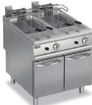
DEEP FAT FRYER (GAS/ELECTRIC) SIZE : CUSTOMIZED (DIE-114) CAPACITY : 8 TO 20 Ltr.