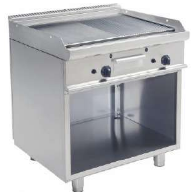
COUNTY GRILL SIZE : CUSTOMIZED (DIE-115)