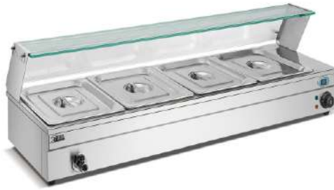
TABLE TOP BAIN MARIE SIZE : CUSTOMIZED (DIE-165)