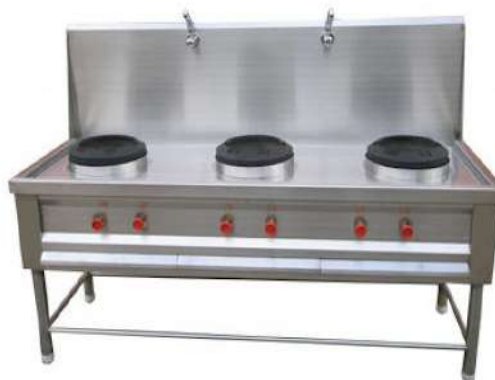
THREE BURNER CHINESE RANGE SIZE : CUSTOMIZED (DIE-105)