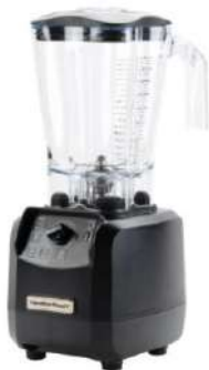
2 SPEED BLANDER