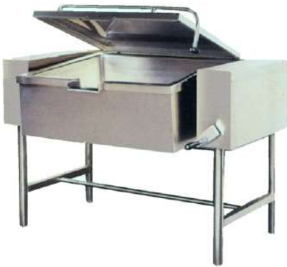
TILTING BRAZING PAN SIZE : CUSTOMIZED (DIE-110) CAPACITY : 52 TO 200 Ltr.