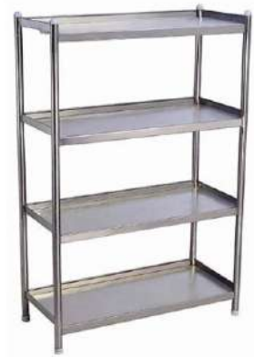
STORAGE / CLEAN DISH RACK SIZE : CUSTOMIZED (DIE-175)