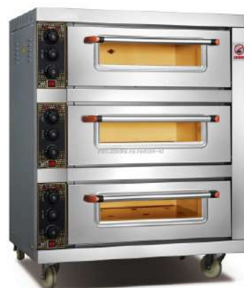
THREE DECK BAKING OVEN GAS/ELECTRIC (IMP/IND) SIZE : CUSTOMIZED (DIE-194)