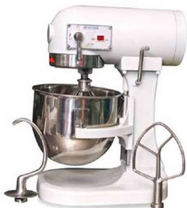
SPIRAL MIXER IMP/IND (DIE-192) CAPACITY : 5 TO 80 Ltr.