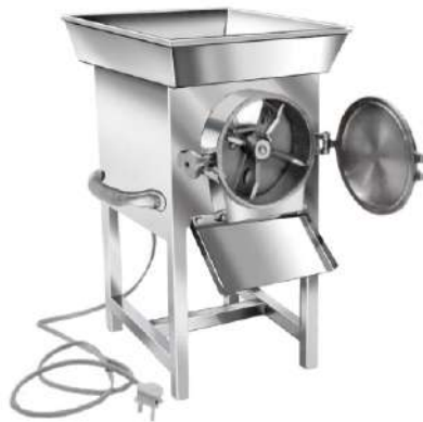
PULVERIZER (ELECTRIC) (DIE-120) CAPACITY : 2/3/5/ HP.