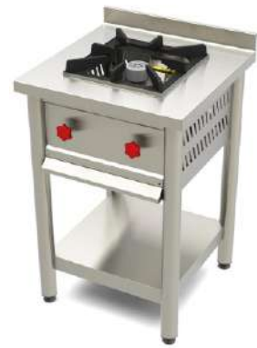
SINGLE BURNER RANGE SIZE : CUSTOMIZED (DIE-103)