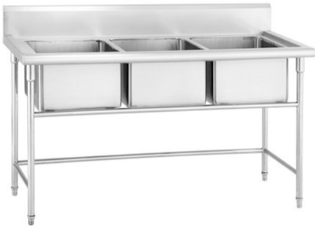
THREE SINK DISH WASH UNIT SIZE : CUSTOMIZED (DIE-128)