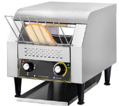
CONVEYOR TOASTER (ELECTRIC) SIZE : CUSTOMIZED (DIE-159)