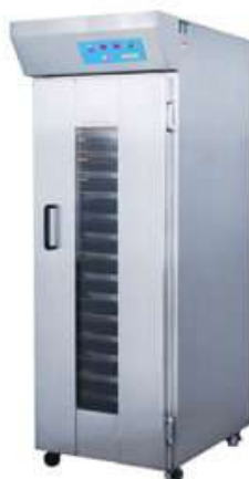
PROOFING CHEMBER SIZE : CUSTOMIZED (DIE-196) SIZE : CUSTOMIZED