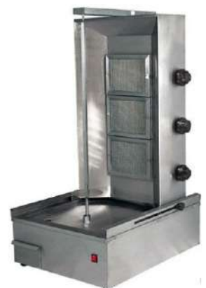
SHAWARMA GRILL (ELECTRIC/GAS) SIZE : 2 TO 4 BURNER (DIE-109)