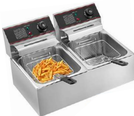
DEEP FAT FRYER (TABLE TOP) SIZE : CUSTOMIZED (DIE-117) CAPACITY : 4 TO 18 Ltr.