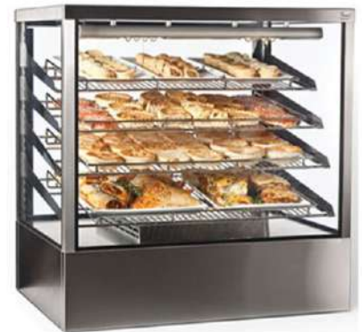
HOT DISPLAY COUNTER SIZE : CUSTOMIZED (DIE-152)