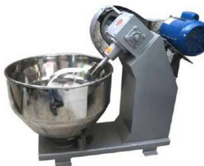
DOUGH KNEADER (ELECTRIC) (DIE-184) CAPACITY : 5 TO 100 Ltr.