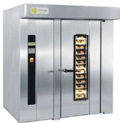
ROTARY OVEN (GAS/ELECTRIC) SIZE : CUSTOMIZED (DIE-193)