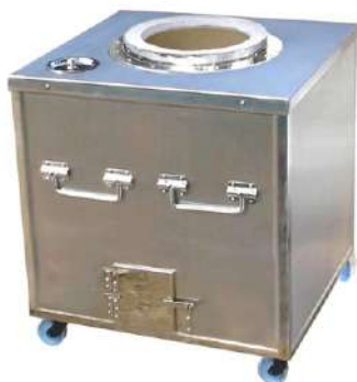
SS MOBILE TANDOOR SIZE : CUSTOMIZED (DIE-116)