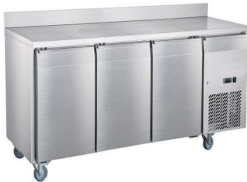
THREE DOOR UNDER COUNTER REFRIGERATOR/ FREEZER SIZE : CUSTOMIZED (DIE-138)