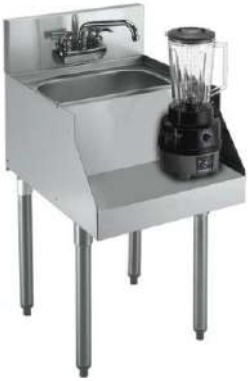
BLANDER STATION WITH SINK SIZE : CUSTOMIZED (DIE-198)