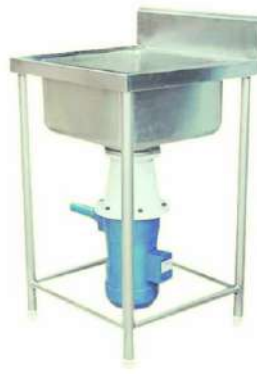
GARBAGE CRUSHER (DIE-133) CAPACITY : 1 TO 5 HP.