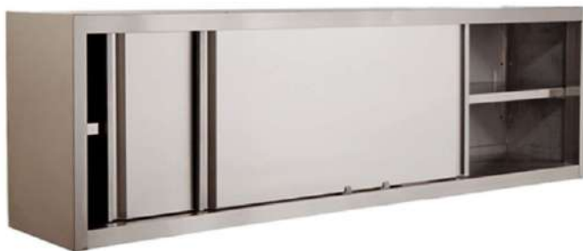
WALL MOUNTED CABINET SIZE : CUSTOMIZED (DIE-179)