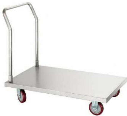
SS PLATFORM TROLLEY SIZE : CUSTOMIZED (DIE-176)