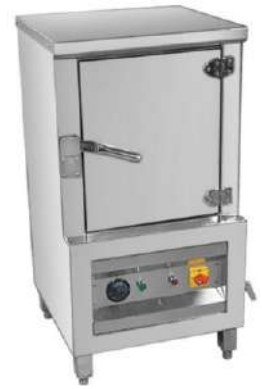
IDLI STEAMER (GAS/ELECTRIC) SIZE : CUSTOMIZED (DIE-112) CAPACITY : 36 TO 250 Idli.