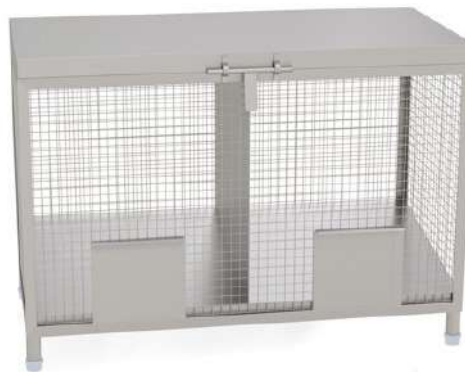
ONION / POTATO BIN SIZE : CUSTOMIZED (DIE-177)