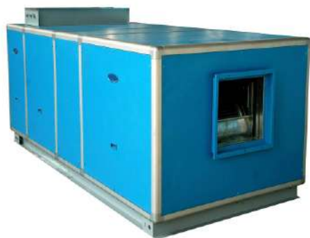
FRESH AIR CENTRIFUGAL BLOWER UNIT CAPACITY : 3 TO 15 HP. (DIE-186)