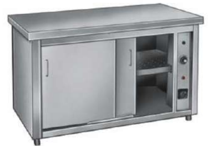
HOT FOOD PICKUP COUNTER SIZE : CUSTOMIZED (DIE-169)