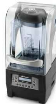
THE QUIET BLANDER