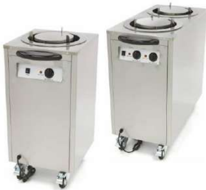
PLATE WARMER (ELECTRIC) SINGLE / DOUBLE (DIE-170) CAPACITY : 50 TO 100 PLATES