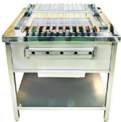
CHARCOAL GRILL (GAS/ELECTRIC) SIZE : CUSTOMIZED (DIE-113)