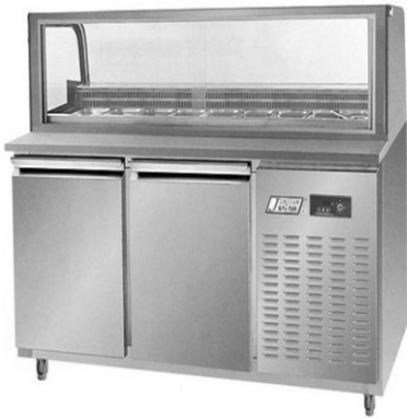
TWO DOOR UNDER COUNTER (PIZZA MAKELINE) REFRIGERATOR/ FREEZER SIZE : CUSTOMIZED (DIE-137)