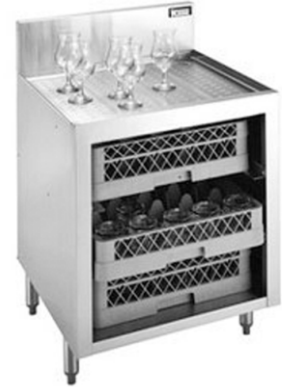
GLASS RACK COUNTER SIZE : CUSTOMIZED (DIE-200)