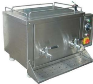
TEA MILK DISPENSER SIZE : CUSTOMIZED (DIE-158)