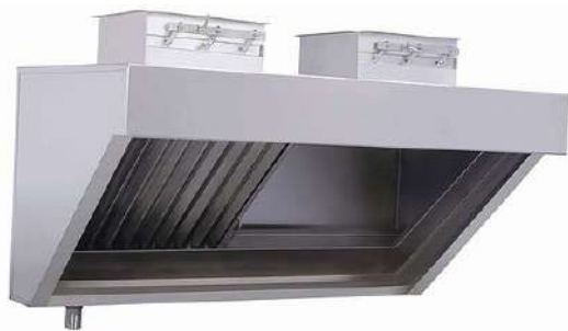
EXHAUST HOOD SIZE : CUSTOMIZED (DIE-181)