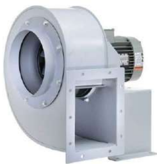
CENTRIFUGAL EXHAUST BLOWER (DIE-182) CAPACITY : 5 TO 15 HP.