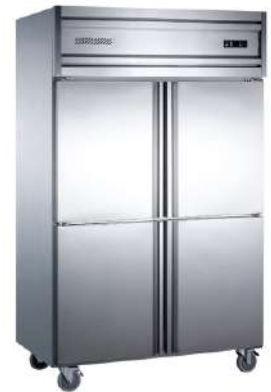
VERTICAL FOUR DOOR REFRIGERATOR/ FREEZER SIZE : CUSTOMIZED (DIE-139)