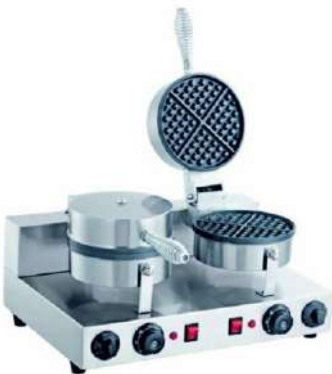
WAFFLE MAKER SINGLE/ DOUBLE (DIE-160) IMPORTED