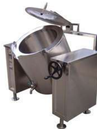
BULK COOKER SIZE : CUSTOMIZED (DIE-108) CAPACITY : 50 TO 200 Ltr.