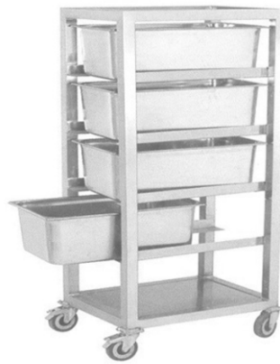
GN PAN TROLLEY SIZE : CUSTOMIZED (DIE-174)