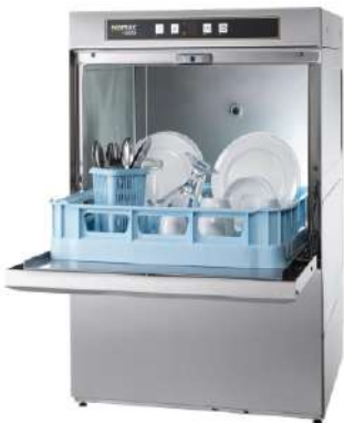
UNDER COUNTER DISHWASHER (DIE-131) STD/IMPORTED