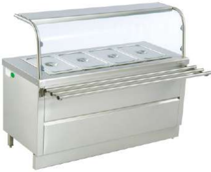
BAIN MARIE (HOT/COLD) FRONT GLASS & TRAY SLIDE SIZE : CUSTOMIZED (DIE-164)