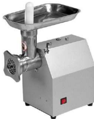
MEAT MINCER (DIE-126) CAPACITY : 20 TO 150 Kg./Hr.