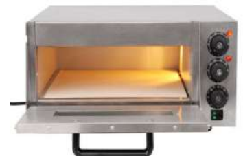
PIZZA OVEN CUSTOMISED / IMPORTED ELECTRIC/GAS (DIE-163)