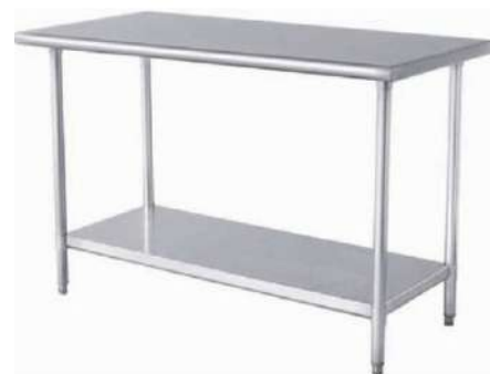
CHAPATI COLLECTION TABLE SIZE : CUSTOMIZED (DIE-188)