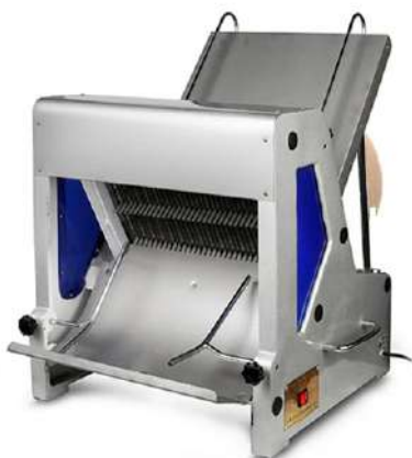
BREAD SLICER (ELECTRIC) TABLE/TOP/ FLOOR MODEL SIZE : CUSTOMIZED (DIE-190)