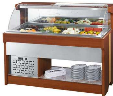
SALAD COUNTER SIZE : CUSTOMIZED (DIE-151)