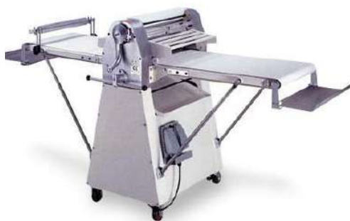
DAUGH SHEETER ELECTRIC (IMP/IND) SIZE : CUSTOMIZED (DIE-195)